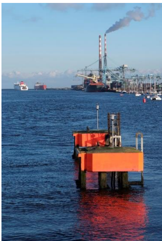
© Moira Sweeney, ‘Rhythms of a Port’